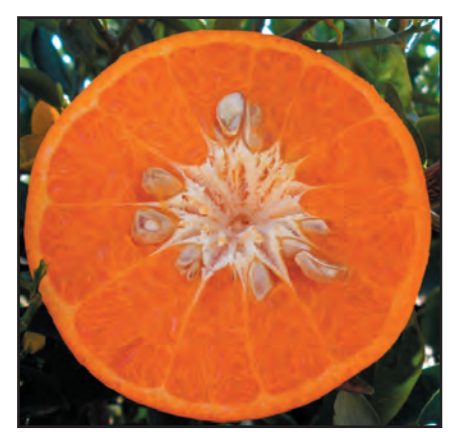
Fig. 4: 'US Furr'