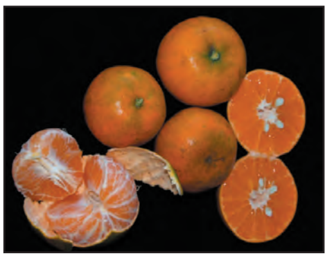
Fig. 2: 'US Furr-ST' Ft. Pierce, FL