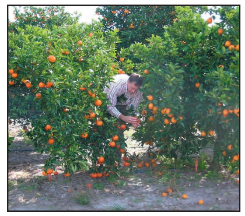
Fig. 5: Trees of 'US Furr-ST' St. Cloud, FL

150-215 g per fruit at maturity (Tables 1 and 2). The fruit have an oblate shape, flattened at the apex and usually with a small navel on the blossom-end (Figs. 2, 3, and 4). The calyx is usually retained on the fruit when snappicked. The rind surface is smooth to lightly pebbly with prominent oil glands. The rind averages 3-5 mm in thickness and is easily removed. Rind color is Mikado Orange to Flame Scarlet (Ridgway, 1912) when fruit mature. There are 12 to 14 segments that separate easily. Flesh color is Flame Scarlet and fruit are juicy with extremely rich mandarin flavor. The fruit core typically displays a small void. Juice is highly colored and is suitable for juice blending.