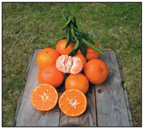
Fig. 3: 'US Furr-ST' Ft. Cloud, FL

150-215 g per fruit at maturity (Tables 1 and 2). The fruit have an oblate shape, flattened at the apex and usually with a small navel on the blossom-end (Figs. 2, 3, and 4). The calyx is usually retained on the fruit when snappicked. The rind surface is smooth to lightly pebbly with prominent oil glands. The rind averages 3-5 mm in thickness and is easily removed. Rind color is Mikado Orange to Flame Scarlet (Ridgway, 1912) when fruit mature. There are 12 to 14 segments that separate easily. Flesh color is Flame Scarlet and fruit are juicy with extremely rich mandarin flavor. The fruit core typically displays a small void. Juice is highly colored and is suitable for juice blending.