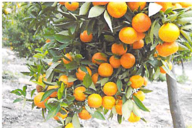
Figure 2: Fruit cluster from young 'DaisySL' tree on Carrizo citrange at Santa Paula

Tree Characteristics: Tree size, growth and fruit production characteristics and rootstock comparisons have been evaluated in trials of 'DaisySL' in comparison to 'Daisy' mandarin from the same field blocks. Six-year-old 'DaisySL' trees in trials at Riverside, and four-year-old trees at the other six sites have been evaluated for two to four years of fruiting. Tree size and growth characteristics of 'DaisySL' have been consistent with 'Daisy' throughout the evaluations. Growth of both 'Daisy' and the 'DaisySL' selection have been quite spreading (characterized as 'leggy') in the first several years of growth followed by a tendency to grow into a more spherical, slightly drooping shape in ensuing years. The nine-year-old mother "Daisy SL" tree at Riverside on Carrizo citrange rootstock is 3.3 m high and 3.7 m wide with a normal upright growth habit, yielding a canopy volume of 23.65 m 3 and production of 77kg. In comparison, two nine-year-old 'Daisy' trees averaged 3.2 m tall and 3.6 m wide, yielding a canopy volume of 21.7 m 3 and a yield of 70.5kg on Carrizo rootstock. 'DaisySL' is not thorny. 'DaisySL' pollen has about 10-20% germination and fruit from hand pollinations onto Clementine or W. Murcott had only 1-2 seeds per fruit.