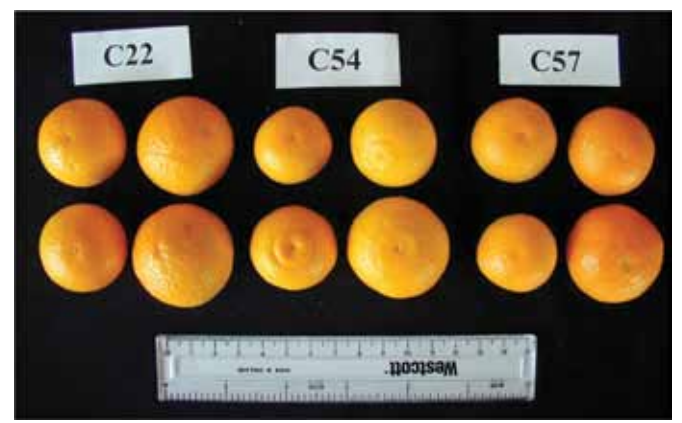
Bitters C-22, Carpenter C-54, and Furr C-57 citrange rootstocks: Photo by M. Roose.

• 'Bitters' produces a small tree, with high yield per canopy volume. Young trees on this rootstock showed good tolerance to freezing. Fruit quality of late navels was good and granulation was no worse than fruit on 'Carrizo' or 'C-35'. It is tolerant to CTV, moderately tolerant of Phytophthora parasitica , not very tolerant of citrus nematode, and very tolerant of calcareous soil. It was reported that this rootstock is the best candidate in Texas to replace sour orange due to its tolerance of calcareous soil conditions.