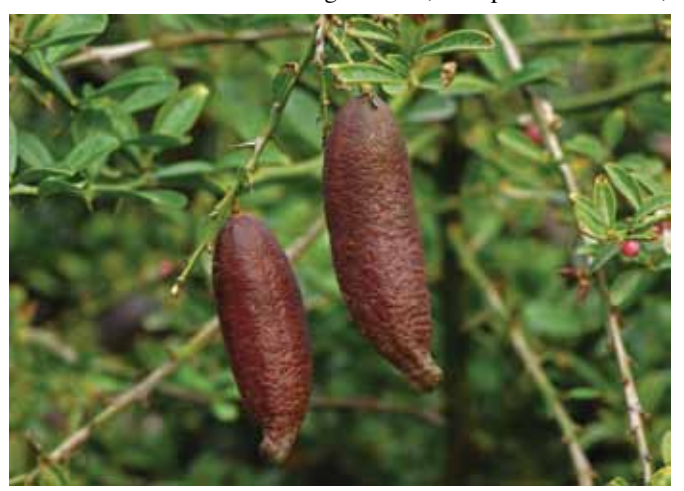
Australian Finger Lime: Citrus Variety Collection, Riverside, California, 5 Dec 2008.

The 'Australian finger lime', a citrus relative also known as Microcitrus australasica , is one of six different species of citrus considered to be native to Australia. This VI is one of 8 different accessions of Microcitrus australasica in the Citrus Variety Collection, and was imported from Sydney, Australia, in 1965. Depending on the type of rootstock used (The CVC has used several: Schaub rough lemon, Cleopatra mandarin,