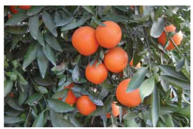
FairchildLS mandarin

rights for Fairchild LS Mandarin are held by the Regents of the University of California. Budwood is available only to nurserymen who have a License Agreement for these cultivars.