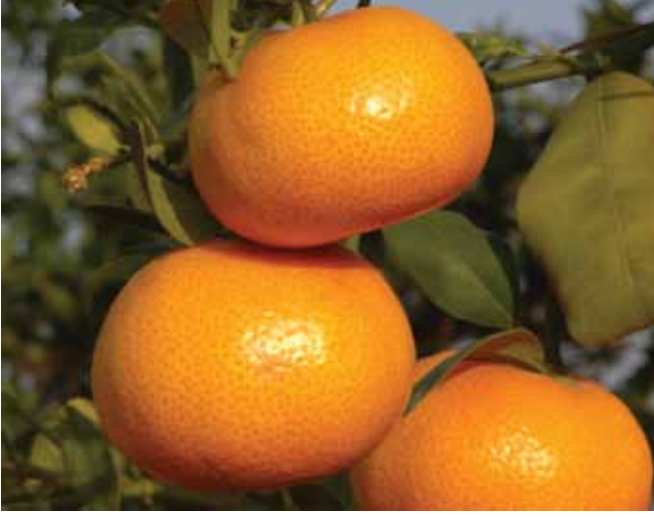
Tango mandarin: Citrus Variety Collection, Riverside, California, 21 Feb 2007.

Tango is a patented (Plant Patent #17863) irradiated selection of W. Murcott mandarin developed at UC Riverside. Fruit of 'Tango' are similar to W. Murcott in all appearance, quality and production characteristics with the exception of seed numbers. 'Tango' fruit are deeply oblate in shape with no neck. The fruit is medium sized for a mandarin (classed as Large by State of California standards and size 28 by industry packing standards) averaging 59 mm (2.32 in.) in diameter and 48 mm (1.89 in.) in height with a very smooth, deep orange rind color. The rind is relatively thin and at maturity is easy to peel. The fruit interior has fine flesh texture with 9-10 segments and a semi-hollow axis of medium size at maturity. The fruit are juicy averaging slightly over 50% juice with an average weight of 90.6 g (3.2 oz.). 'Tango' matures in winter (late January) and holds its fruit quality characteristics through April into May. Production is excellent averaging 800-900 cartons/acre when planted at densities of 250-300 trees/acre. Fruit from trees on Carrizo and C-35 citrange rootstocks average 11.1-13.1% soluble solids and 0.97-1.19% acid in January increasing to 13.5-15.4% soluble solids with decreasing acid of 0.54-0.82%