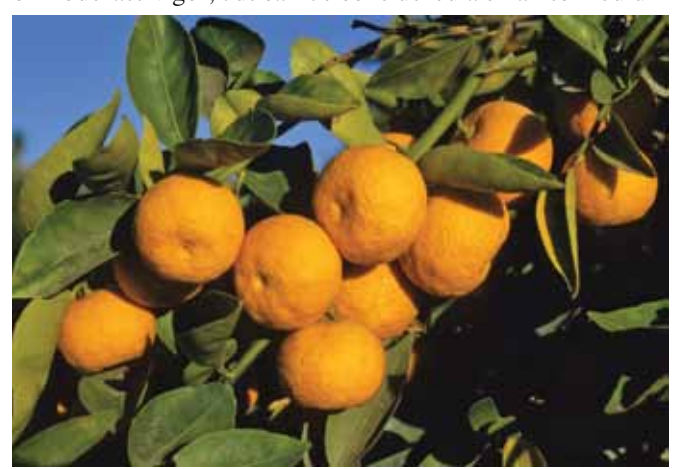
Sudachi ichandarin: Citrus Variety Collection, Riverside, California, 15 Nov 2002.

sized tree, as 26-years-old trees on Carrizo and C-35 citrange rootstocks are only approximately 8 feet tall, with no indications of rootstock-scion incompatibility. Thorns up to 5 mm in length are present in each leaf axil. Leaves are elliptical in shape, with a small winged petiole. The tree canopy has dense branching. (Kawada, K., and Kitagawa, H. "Storage of Sudachi ( Citrus sudachi Hort. ex Shirai) in Japan". Pro. Int. Soc. Citriculture, 1084-1085. 1992. Kawada, K., and Kitagawa, H. "Citriculture, Marketing are Different in Japan". Fresh Citrus Fruits. Avi Publishing Company: Connecticut. 1986.)