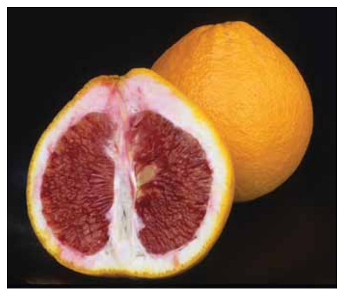
Valentine pummelo hybrid: Citrus Variety Collection laboratory, Riverside, California.