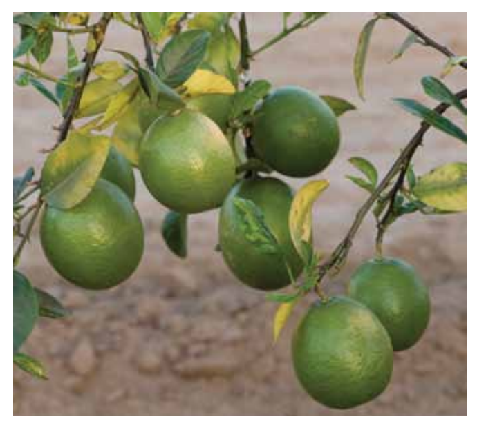
Lemonade: Citrus Variety Collection, Riverside, 3 Nov 2009.

'Lemonade' is reported to be a sweet lemon hybrid of unknown parentage with a very pleasant taste, and can be readily but not easily peeled. The fruit is small-medium, and not very seedy. The trees are semi-dwarfed (on trifoliate rootstock), but quite productive. The main crop matures in early spring in New Zealand, with much smaller summer crops also occurring. Unfortunately there is no commercial production in New Zealand, although it is a popular home garden tree. It is susceptible to citrus scab disease; however, in a drier climate this should be less of a problem. (This information redacted from an email from Andrew Harty via Peter Chaires, 12/07/2005) Although the budsource trees are derived from trees at the CCPP that tested negative for all known graft-transmissible diseases, trees of 'Lemonade' propagated in Riverside have shown a tendency to develop small brown to black lesions on the bark. The reason for these lesions is currently unknown. 'Lemonade' trees propagated at Riverside are not particularly vigorous but the relationships of this to the observed lesions is not known.