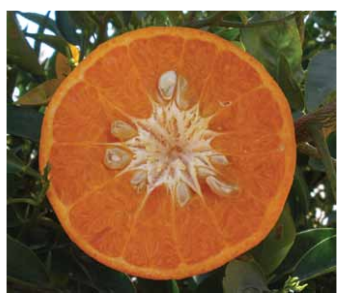
'C54-4-4' mandarin: Citrus Variety Collection, Riverside, California, 16 Feb 2010.

'C54-4-4' was selected for introduction to California in 1997 by members of the California Citrus Nurserymen Society (CCNS) during a tour of the INRA-CIRAD Station de Recherches Agronomiques in San Giuliano, Corsica, associated with the Congress of the International Citrus Nurserymen's Society. C54-4-4 is actually a product of California, being a cross of 'Clementine' X 'Murcott'. The cross was actually made at the USDA Horticultural Research Laboratory in