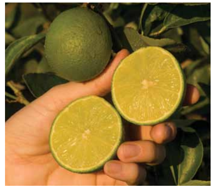
Persian lime: Citrus Variety Collection, Riverside, California, 3 Nov 2009.